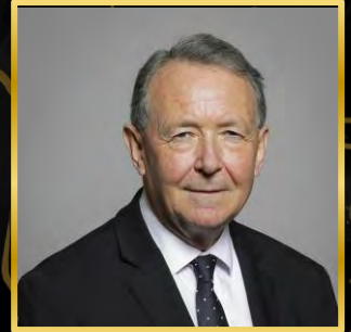
Lord David Alton UK Parliament Life Peer