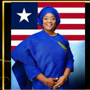
Former Vice President Liberia Jewel Howard-Taylor