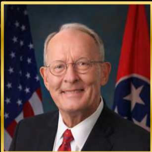
Former Senator Lamar Alexander, Tennessee