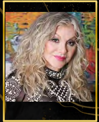
Stella Parton Actress/Country Music Artist