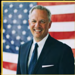
Lt. Governor Dan Forest North Carolina