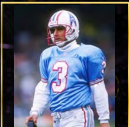
Al De Greco - NFL