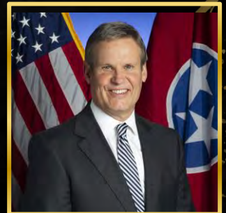
Governor Bill Lee Tennessee, USA