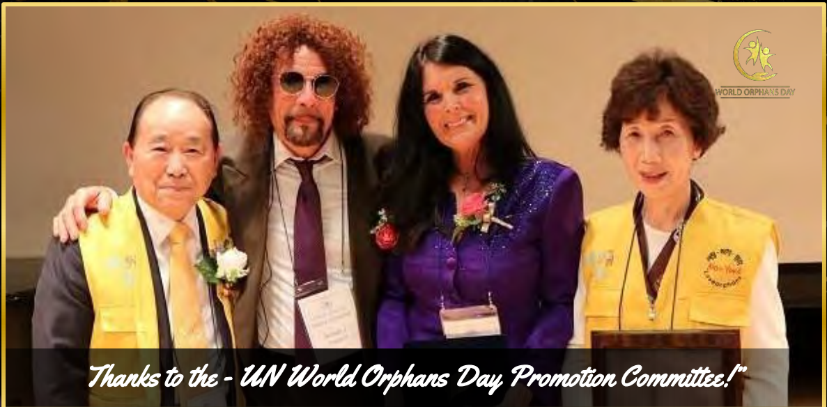
Thanks to the - UN World Orphans Day Promotion Committee!"