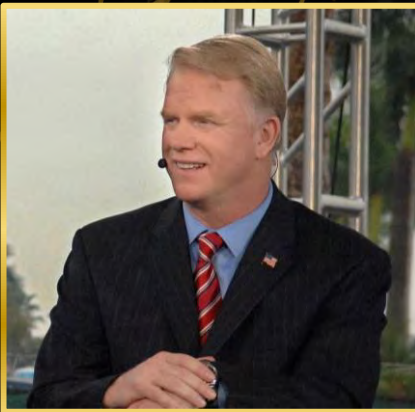
Boomer Esaison NFL Television Anchor