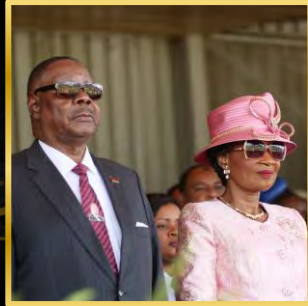
President Peter Mutharika and First Lady Malawi