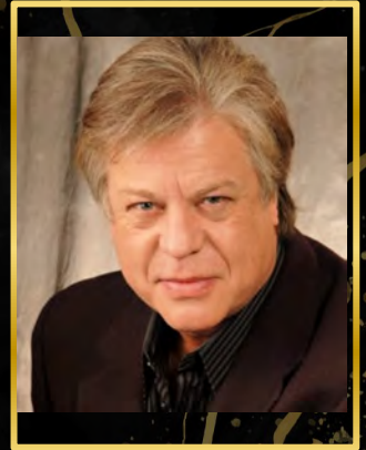
Brad Maule General Hospital