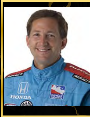
John Andretti NASCAR Driver