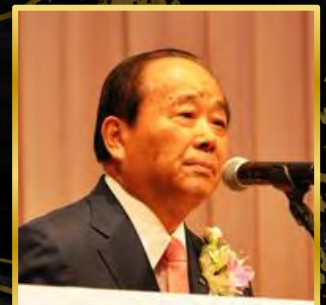
Motoi Tauchi- Chairman UN World Orphans Day Promotion Committee