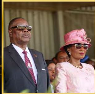
President Peter Mutharika and First Lady Malawi