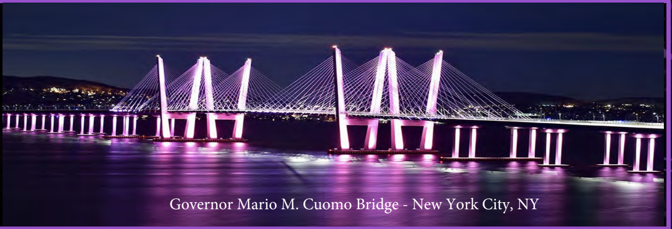
Governor Mario M. Cuomo Bridge - New York City, NY