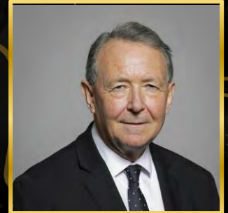
Lord David Alton UK Parliament Life Peer