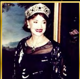
Princess Elizabeth of Serbia