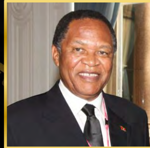
Deputy Prime Minister Themba Masuku Eswanti