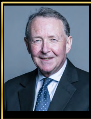
Lord David Alton Life Peer British Parliament