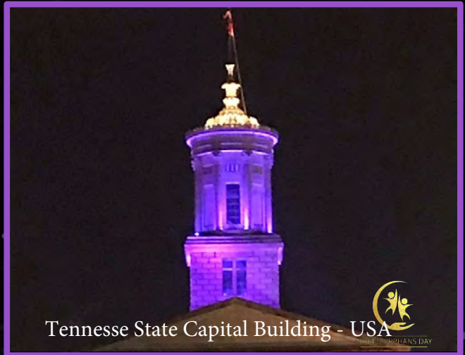
Tennessee State Capital Building - USA