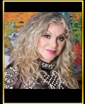
Stella Parton Actress/Country Music Artist