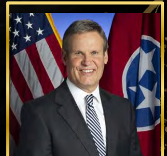
Governor Bill Lee Tennessee, USA