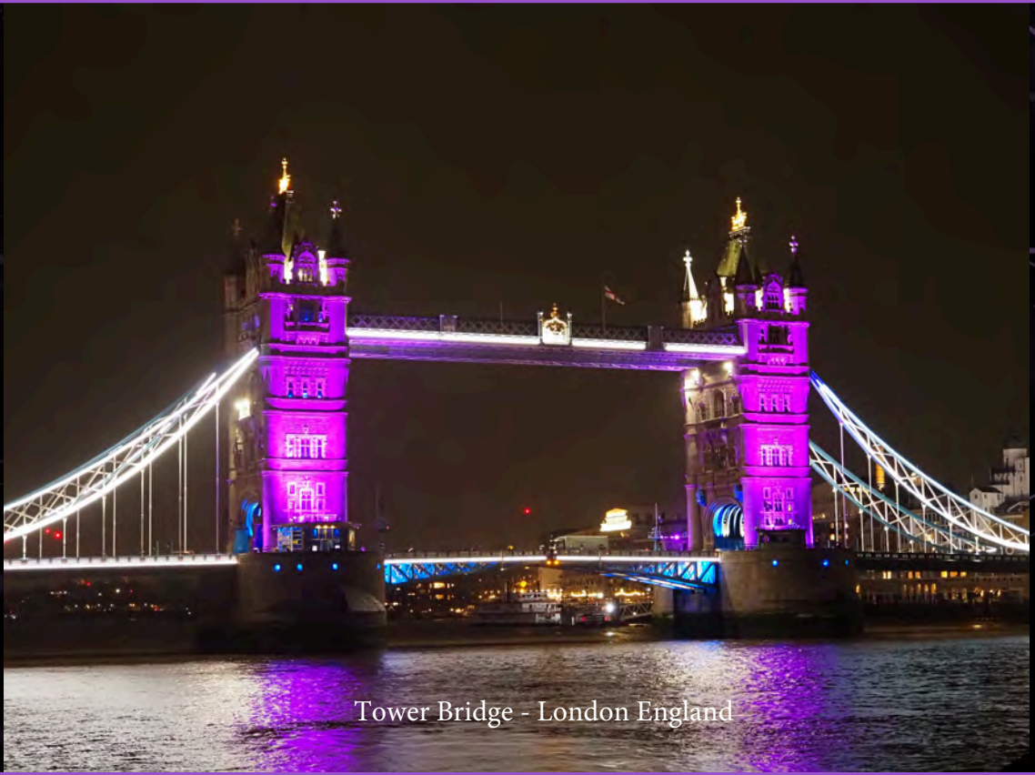
Tower Bridge - London England