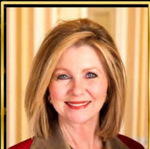
Senator Marsha Blackburn, Tennessee