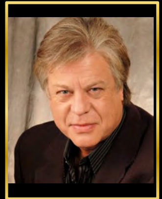
Brad Maule General Hospital