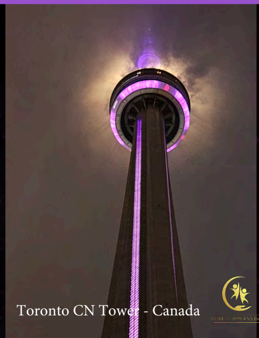
Toronto CN Tower - Canada