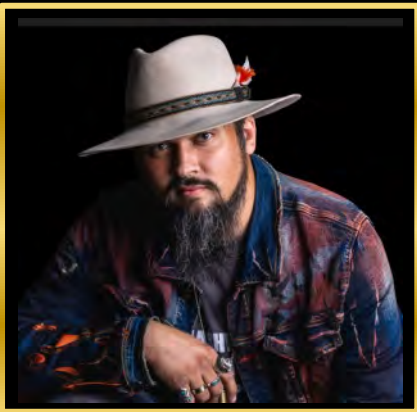
Clayton Q Country Music Artist