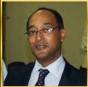
Prince Ermias Sahle Selassie Ethiopia