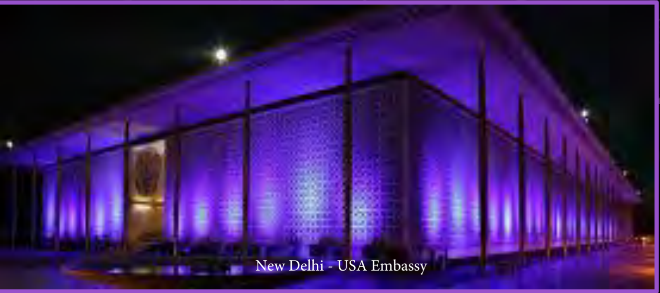
New Delhi - USA Embassy