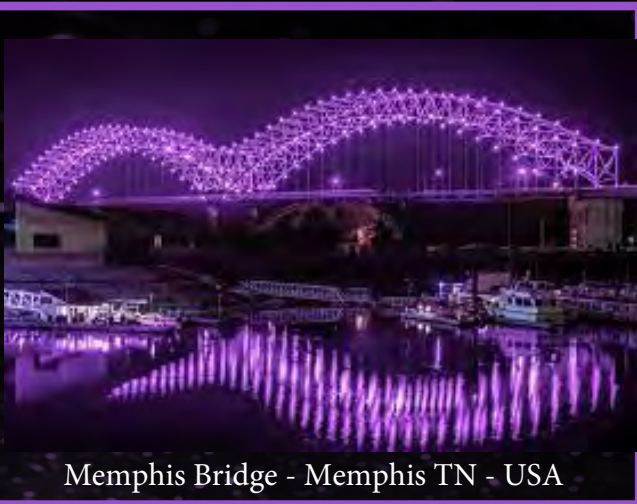
Memphis Bridge - Memphis TN - USA