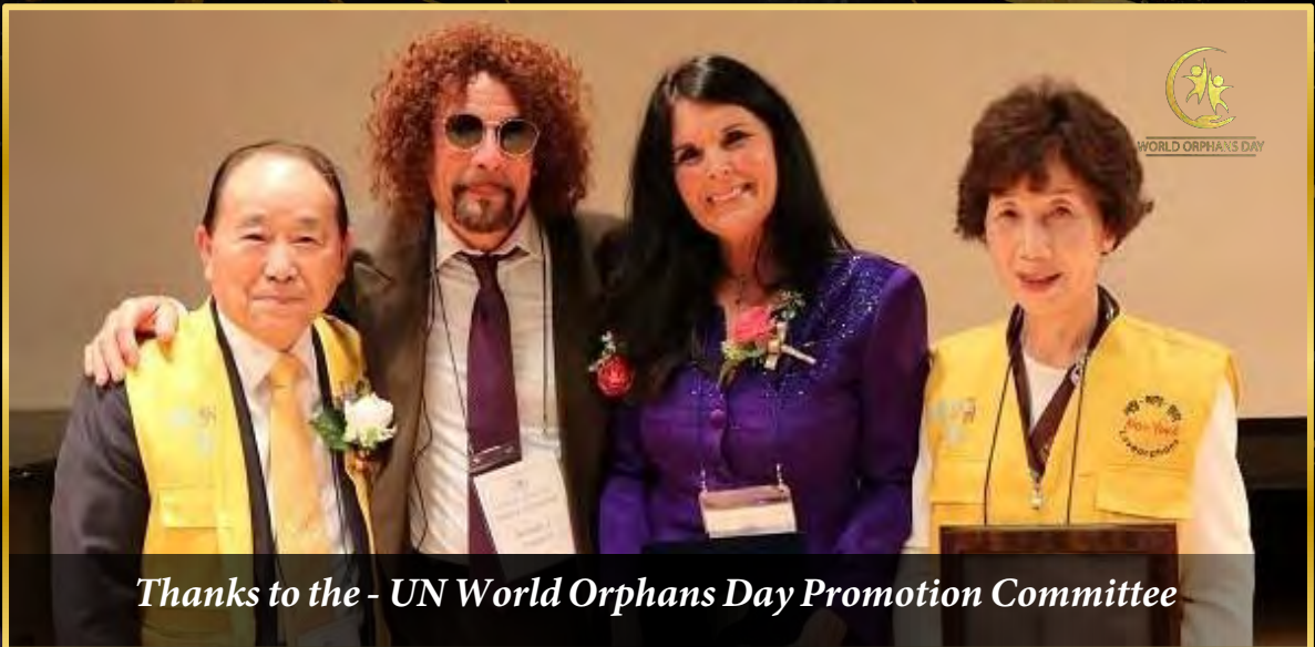
Thanks to the - UN World Orphans Day Promotion Committee

You Can Make A Difference - Please Donate Now