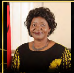
First Lady Malawi Monica Chakwera