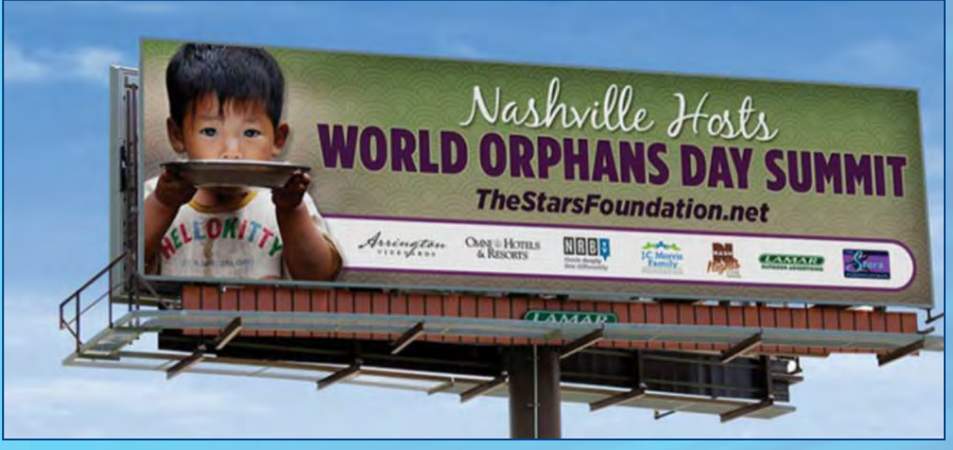
National American Highway Billboard Campaign